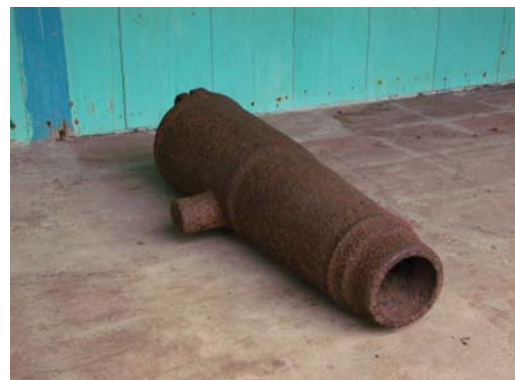
The Porter Expedition cannon, hauled up to Taipivai in November 1813 by Porter and his men.

The Te I'i and Hapa'a warriors began to turn on the Americans soon after the defeat, leading Porter to fear for Madisonville. In order to prove his authority, Porter led most of his men and a few Te I'i on an overland nighttime hike up to Taipivai, the heartland of the Taipi settlements. The attack had to be postponed since the following day was rainy and moisture had temporarily ruined the gunpowder. The attack began on November 30 th , and this time despite another ambush the Americans and Te I'i subdued the Taipi who after ignoring a message warning them of the consequences of not calling a ceasefire, had several of their settlements burnt. Taipi emissaries were sent soon after, carrying "countless" hogs as a peace offering.