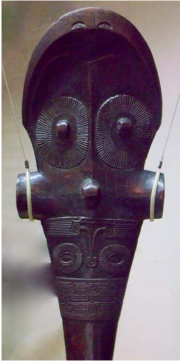
Marquesan war club