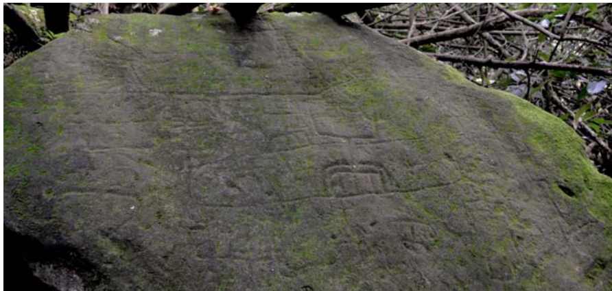
Geometric motifs on a boulder at Kahuvai, Nuku Hiva