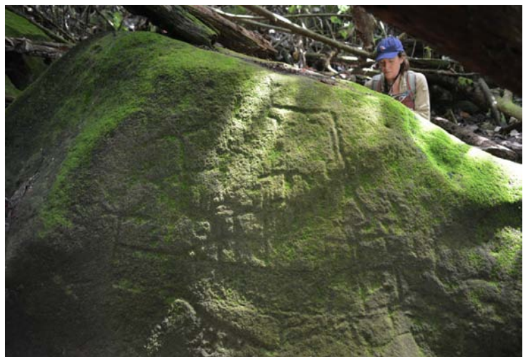
Team member Alexandra Edwards recording petroglyphs on a boulder with geometrical motifs at Kahuvai, Nuku Hiva

Although petroglyphs are found in all of the above-mentioned contexts, most of them are located around major waterways in the most fertile part of valleys. The largest concentration of rock art is directly associated with ceremonial structures. When petroglyphs are carved on large boulders, usually the biggest one in the site was chosen and several sides of the stone were carved. A few large boulders however, may only contain one small figure in a corner of the rock. Superimposition, though relatively uncommon, is present and may have a panel richly carved with a myriad of figures. Overlapped carvings often give us an indication of how styles change over time. Interestingly, an overwhelming majority of rock art panels in Hatiheu face north and towards the ocean, although according to ethnographic sources there was no name for a northern direction in the Marquesas, nor did it have any special meaning.