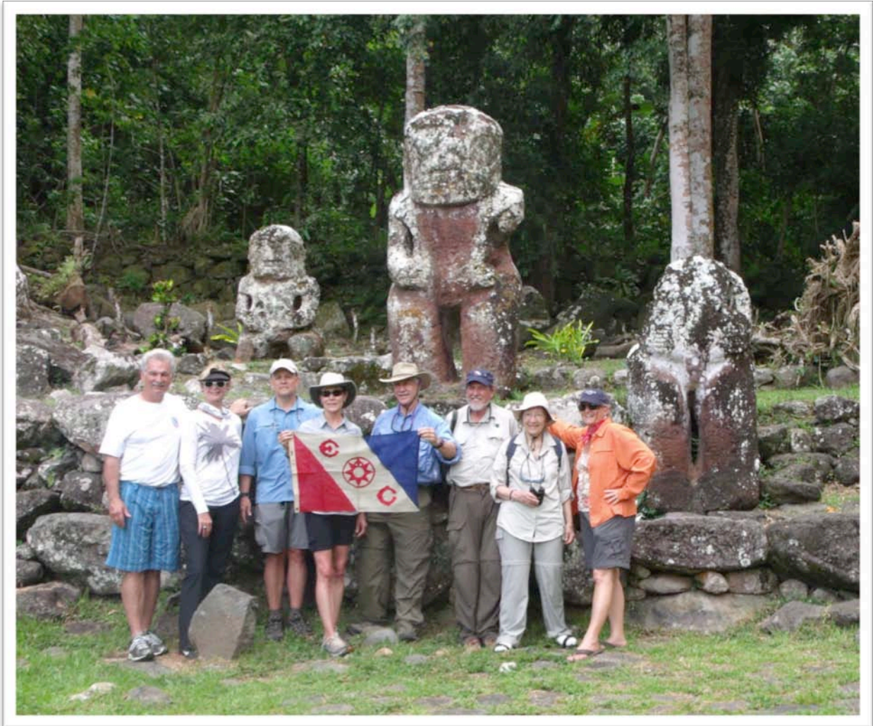
Explorers Club Flag #56 Expedition team 2013 at Me'ae Oipona on Hiva Oa