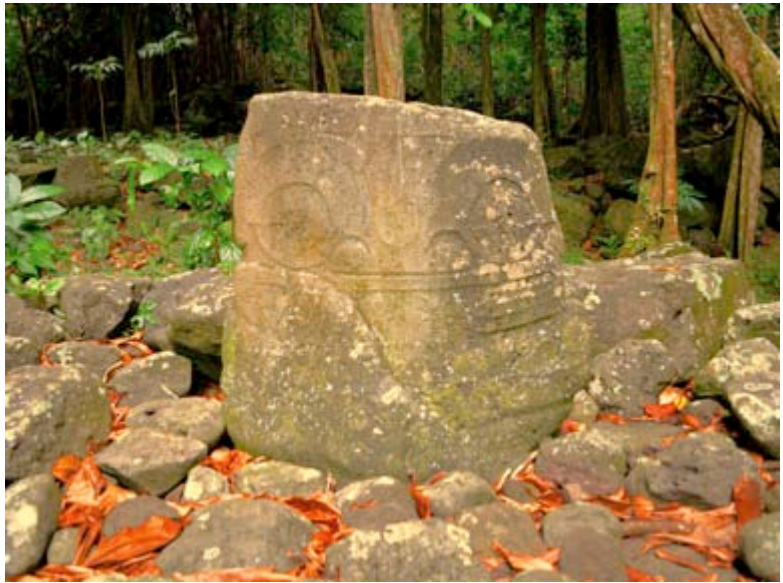
Tiki on a tohua at Taaoa Valley, Hiva Oa

Sculptured stone images called tiki (which today refer to any depiction of a human figure on stone, wood, on cloth, and as tattoo) probably evolved from the tradition of engraving anthropomorphic figures on rocks and carved wooden pillars for houses and other structures. Most of the images are located or associated with structures that have been dated to the Expansion (AD. 1100-1400) or Classic period (A. D. 1400-1790). The Classic period is