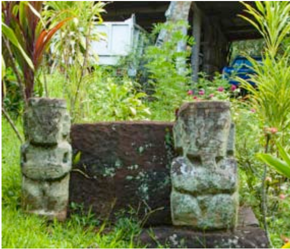
Tiki on a tomb on private property, Hiva Oa

Due to difficulties associated with transportation to isolated valleys, environment, climatic condition, and the high cost of conducting research on these islands, different field methods have been used and modified in order to improve recording speed and accuracy. Since the sites had all been duly registered in written form and properly mapped, our aim was to digitally photograph as many petroglyphs as possible since the only existing complete photographic record of these sites disappeared in a fire in the late 1990s. The idea is to ultimately process the photographs with digital imaging