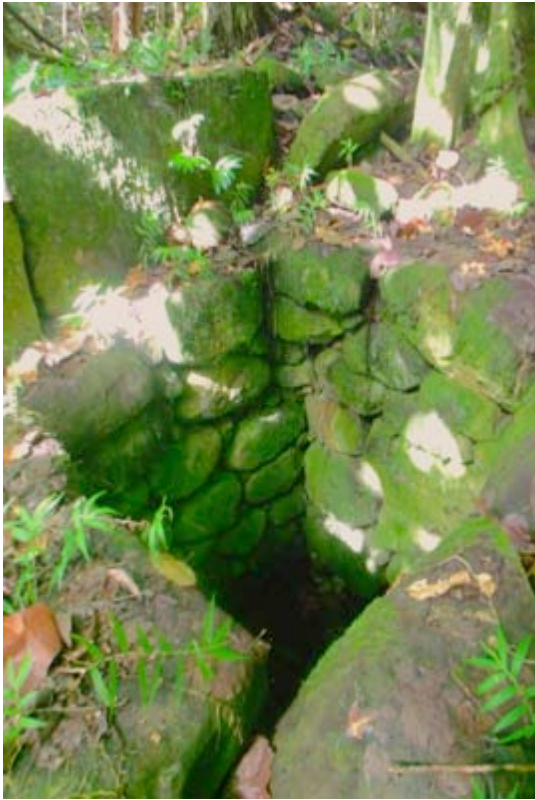
Taro pit, near Kahuvai, Nuku Hiva

Cultural and linguistic evidence indicate that the first settlers of the Marquesas originated from Western Polynesia and may have arrived as early as 600 AD. Over a period of several centuries these adventurous voyagers introduced to the Marquesas many plants of economic and cultural value such as: different varieties of breadfruit, taro, bananas, sugarcane, and yams. The first two were the main staple in all of the Marquesas and fermented breadfruit paste was preserved in enormous underground communal silos called ua maa in the local language. Our expedition team visited and photographed one of these pits in a remote part of Hatiheu valley. Taro was planted in irrigated terraces that covered most of the valley floor. Polynesian dogs, jungle fowl, and pigs were also introduced as food in ancient times, but by the time of European discovery dogs had become extinct and animal husbandry was limited to raising pigs.