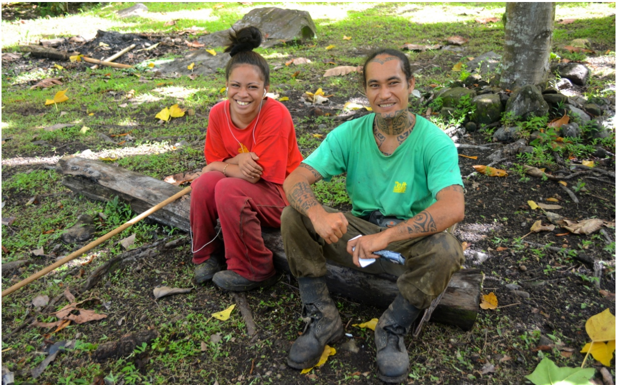
Marquesan youths at Tohua Koueva, Taiohae, Nuku Hiva

Of all the diseases that arrived to the Marquesas, the most deadly was smallpox, which arrived in 1864, when Peruvian blackbirders knowingly repatriated three Marquesan men who had previously been kidnapped and infected in the port of Callao before being returned home. The epidemic spread quickly with dear consequences for the local populations. According to missionaries settled in the Northern Marquesas, this disease killed 60-70% of the local population, while some settlements, such as Hatu Atua and Anaho in Nuku Hiva, were completely depopulated. In addition, cannibalism and inter-tribal warfare continued until nearly the 1870's in some remote valleys leading to a rapid decrease in population. Furthermore, Chinese workers who were brought to work in European vanilla and copra plantations introduced opium to the islands, and many Marquesas became addicted to its use. By the 1900s Marquesans seemed to be in danger of extinction. Fortunately, this did not happen. Present-day Marquesans feel very proud of their heritage, history, and traditions and have formed several cultural organizations dedicated to the preservation, enrichment, and diffusion of Marquesan culture, which is very much alive in all of the Marquesas today.