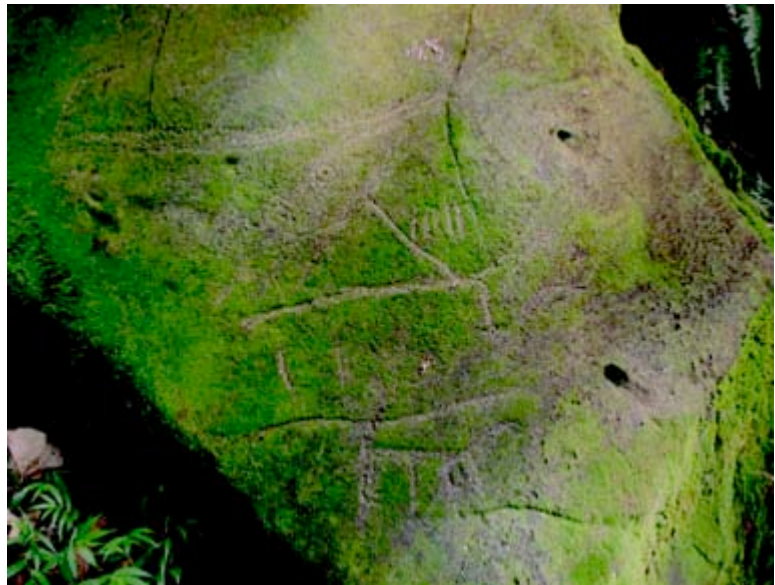
Dog petroglyphs at Kahuvai, Nuku Hiva

In the remote western part of Hatiheu valley, in an area known as Kahuvai there are several boulders with petroglyphs, depicting several fish figures with 1-4 cupules on their backs depending on the size of the figure. A carved dog appears in the same panel. Two more dog petroglyphs were recorded in a nearby panel, as well as other fish figures. Dog motifs have also been recorded on