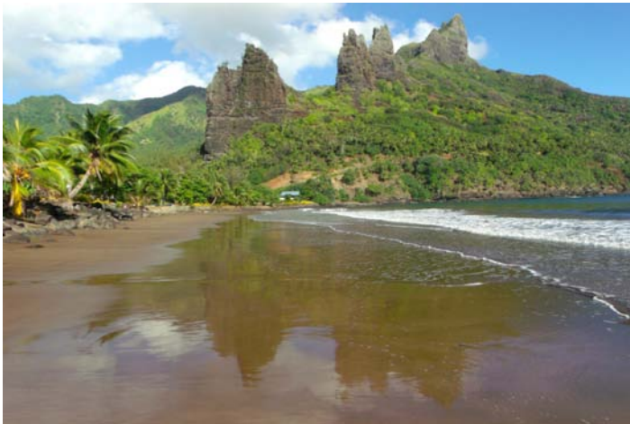
Hatiheu coastline, Nuku Hiva

The Marquesas islands, named “Te Henua Enata” or “The Land of Men” by their Polynesian discoverers, are located approximately 1,370 km northeast of Tahiti and 4,800 km west of Mexico. Although they are part of French Polynesia, geographically they are one of the most remote island groups in the world and the most distant from any continental land mass. The archipelago is formed by a string of islands that extends about 230 miles from northeast to southeast and is located 8°-11° South latitude and between 138°-141° West longitude. The archipelago is divided into two distinct separate island groups. The Northern group is comprised by Nuku Hiva, Ua Pou, Ua Huka, and the two uninhabited islands of Eï’ao and Hatutu. Hiva Oa, Tahuata, Fatu Hiva, and uninhabited Fatu Huku and Motane form the Southern group. The total land area is about 1,050 km 2 with a population of approximately 9,000 inhabitants with a similar number of Marquesans living in Tahiti. Our Expedition was circumscribed to working in the two largest islands of each group, Hiva Oa and Nuku Hiva, in the Southern and Northern groups respectively. Nuku Hiva is also home to Taiohae, the administrative capital of the Marquesas.