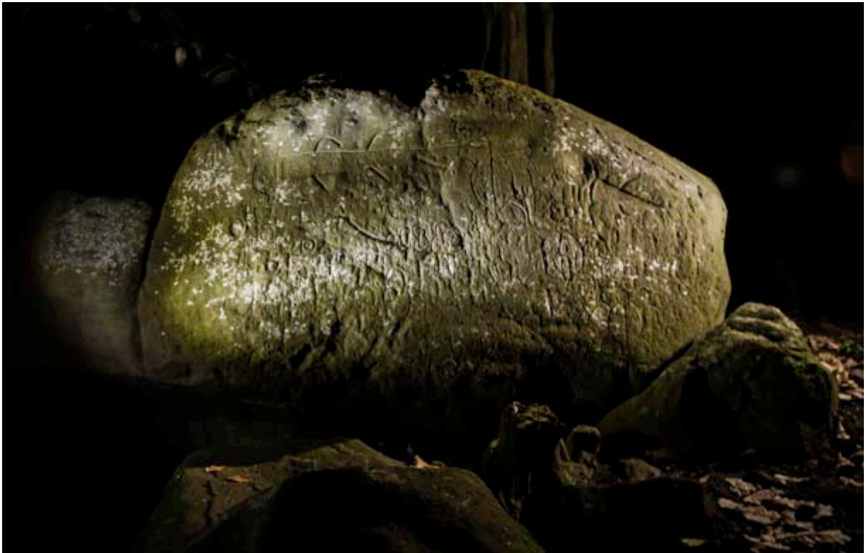
Light-painted petroglyphs on a boulder at Tohua Kamuihei, Nuku Hiva

The accumulated rock art inventory from the Marquesas Islands exhibit a sophisticated and rich carving tradition. Petroglyphs, which are by far the most common form of aboriginal rock art, have been recorded on all the islands surveyed. Possibly due to the unusual intense survey on Nuku Hiva, most of the sites have been recorded there. Our team recorded petroglyphs at Tohua Kamuihei by light-painting them at night, which accentuates the many figures carved on the stones.