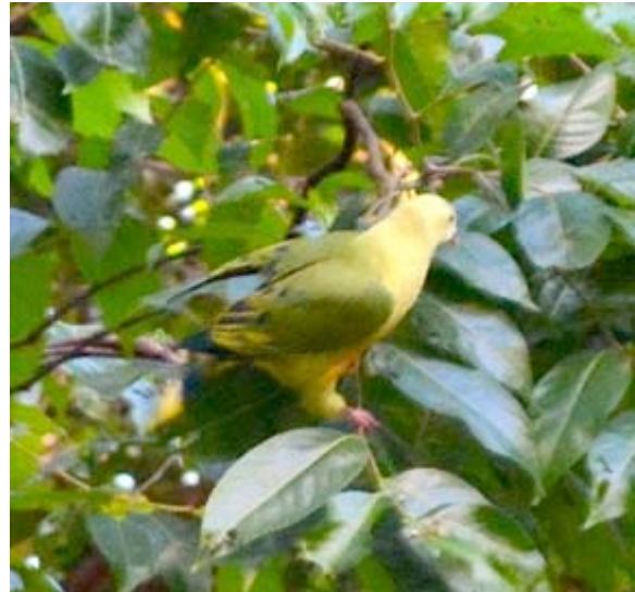
White-capped fruit dove

Like most volcanic islands, the original flora of the island arrived by flotation and wind-dispersal in addition to in the beaks, feathers, and guts of vagrant birds. Although the Marquesas have a diverse marine fauna, the islands are not protected by coral reefs, thus they have fewer marine species than their neighbors the Society and Tuamotu Islands. The terrestrial fauna of the Marquesas is mostly limited to birds, many of which are endemic. In fact, 42% of the plants and animals found in the Marquesas are natural to the islands. Our team was fortunate enough to observe and photograph the white-capped fruit dove ( Ptilinopus dupetithouarsii ), one of eight birds endemic to the Marquesas (pictured right). Unfortunately, 18 of the 26 birds endemic to French Polynesia are in danger of extinction as a result of predation, disease, habitat changes, and unregulated hunting in past times. In relation to the number of native species, land area, and population size, this is the highest number of endangered birds in the world.