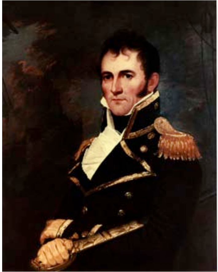
Portrait of Captain David Porter (Oil painting possibly by William Turnbull)