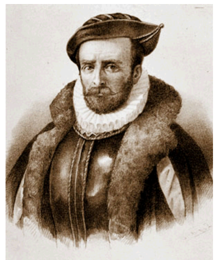
Portrait of Alvaro de Mendaña

Spanish Captain Alvaro de Mendaña was the first Westerner to record the existence of the Southern Marquesas, arriving to Fatu Hiva in 1595. Mendaña named the island group the “Islas de Marquesas” in honor of the wife of his patron Don Garcia Hurtado de Mendoza, the Viceroy of Spain in Peru. This first contact was very violent with several hundreds of Marquesans being killed by the. The islands remained undisturbed for hundreds of years until Captain James Cook visited the Southern Marquesas in 1775, while the Northern Marquesas were not discovered until 1791 by American Captain Joseph Ingraham on board a whaling ship. Ingraham named the group the Washington Islands and claimed them for the United States, but this was never ratified. However, this led American Naval Captain David Porter to try and reclaim the Northern Marquesas while at war with the British in 1813. Porter built a settlement and fort called Madisonville, on Nuku Hiva. This little-known episode of American history is the subject of a short mini-documentary we shot at Nuku Hiva as a corollary to our expedition and will be discussed in greater detail later in this report. Other famous visitors to the Marquesas are Herman Melville, Robert Louis Stevenson, Paul Gauguin, Jack London, and Jacques Brel, all of whom recorded the traditional way of life.