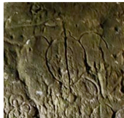
Turtle petroglyph at Kamuihei