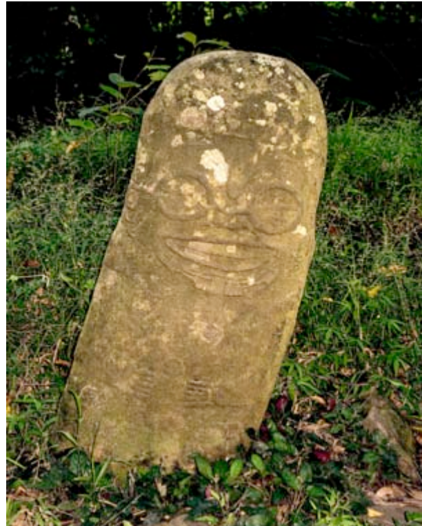
Remote tiki between Aakapa and Hatiheu, NH

Marquesan statues also usually have a broad flat nose with nostrils that fill out most of the center of the face. A long, wide, and oval mouth, sometimes with a protruding tongue, covers the lower part of the face. Many of the images have geometric tattoo designs finely incised on the sides of the mouth, chest, or on the thighs. Breasts and nipples are not to be missed, and the back of the figure often has a spine and buttocks carved on it, regardless of the placement of the statue. Some of the images have the arms separated from the torso, while on others the arms are hardly indicated. Hands with fingers are sometimes placed stretching across a protruding abdomen, the seat of ritual knowledge. Little detail is apparent on the legs, which are usually stubby and flexed below a wide pair of hips, if they appear at all. Circular knobs sometimes represent ankles and a few of the images have toes. Many Marquesan statues are secured into the ground by a long projection. Sizes vary between 0.14-2.5 meters above the ground. Each statue was named after the deified chiefs/chiefs or inspirational priests/priestess they represented. Few of the names however, are remembered today.