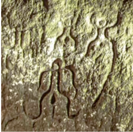
Human figures at Kamuihei