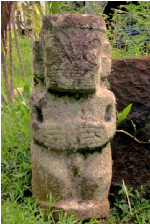
Detail of a tiki in Puamau, Hiva Oa

known for the development of large megalithic stone structures, carved images, and rectangular cut slabs of red tuff, which were placed on top of the terraced platforms of chiefs and important priests as signs of prestige. Often these slabs would depict one or a couple of naturalistic-looking human figures in bas relief.